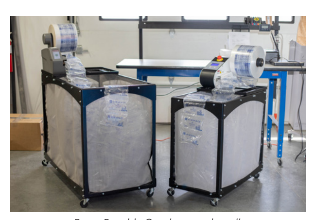
Rover Portable Cart, large and small