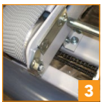
3 Self-tensioning & self tracking 3" wide drive belts