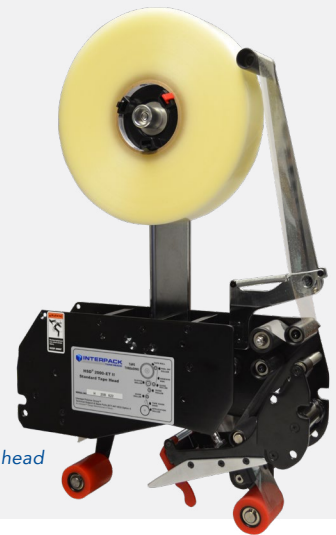
ET 2Plus tape head

When you compare features, benefits and value, Interpack Case Sealers are the right choice for operators, plant engineers, maintenance and purchasing.