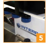
5 3-wheel top squeezer