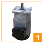
1 ½ HP lower and ¼ HP upper gear motors to process cases up to 85 lbs.