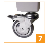
7 Optional swivel & locking casters