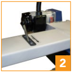
2 Single handle locks upper head to both columns