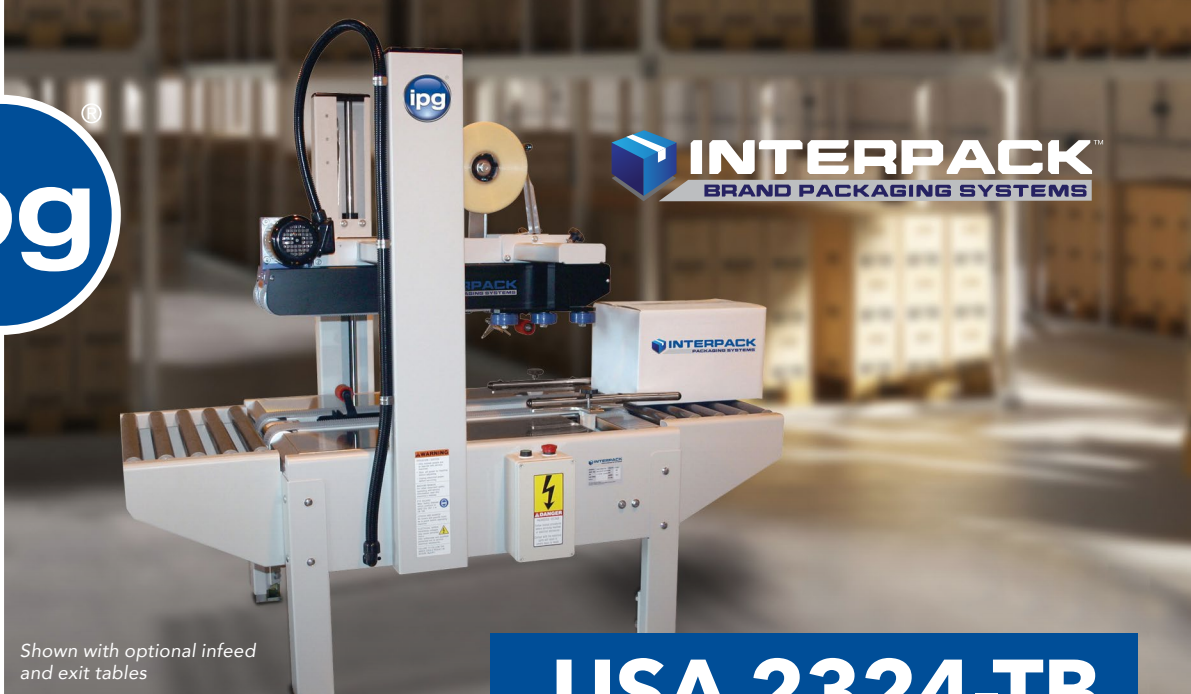
Shown with optional infeed and exit tables