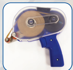
Close cover. Pull trigger to apply ATG to surface.