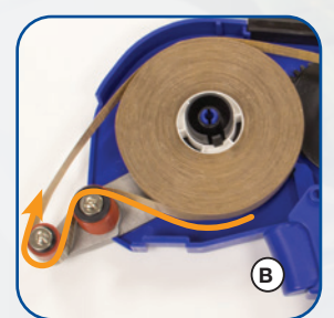
Press trigger (B) while threading ATG tape as shown.