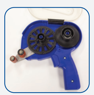
Start with opening the dispenser on a flat surface.