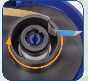
Loop liner through retainer and rotate counter-clockwise to tighten.